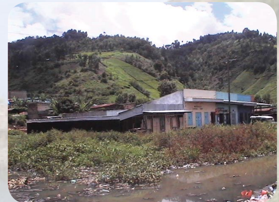
Pollution is a major environmental concern